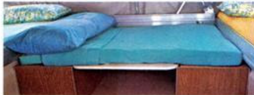
At night, it's a bed . . . just right for two small children to get a big night's sleep. Table stores out of the way, when not in use.

Looking for a lightweight, maintenance-free camping trailer with two large double beds up off the ground? And a dinette that makes into an extra bed for the kiddies? Then the new Eagle is for you. You'll like the stylish, yet functional aluminum road cover. It provides convenient storage space in camp, locked protection when on the move. Eagle is a sharp, yet practical, unit with quality to spare. See one at your dealer's.