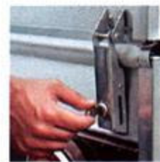
The exclusive Apache locking road cover means you can "lock up" when you're on the road and keep your personal belongings safe at all times. Also prevents accidental opening of cover.