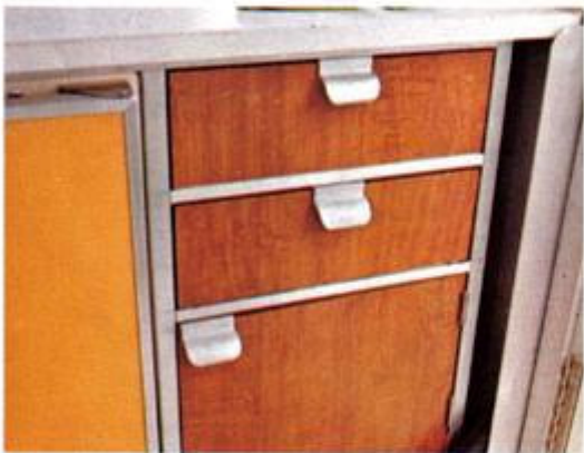
Aluminum-framed cabinets combine practical service with a luxury look. Can't warp or twist ever. All interior paneling is covered with exclusive scratch-resisting, easy-to-clean Permaface laminate, stronger than conventional paneling.