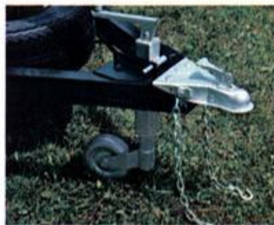
Tongue jack unit with wheel maneuvers trailer easily for hookup. Stores for traveling.