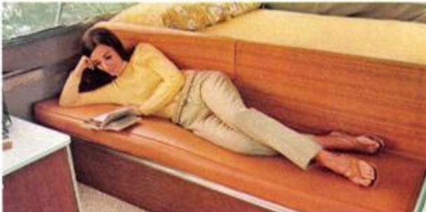
The Gaucho couch converts to a thick-cushioned bed (or vice versa) in an instant. Underneath is 11 cubic feet of convenient storage space. Exclusive comfort-contoured seat construction gives you "easy-chair comfort."