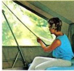
Plastic windows let in plenty of light, keep rain out.