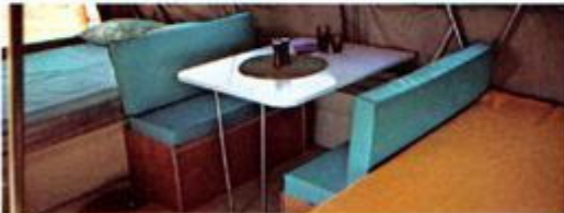
The new Eagle dinette provides a comfortable and spacious eating or sitting area inside.