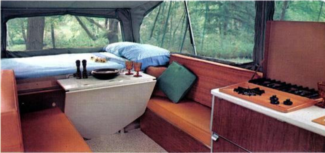
The dinette in Mesa II and III gives the entire family plenty of room. And the table can be changed in a wink to an end table (shown) to give the family more legroom when they're just lounging around. On Mesa III the interior is tastefully color-coordinated throughout.