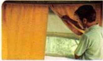
New privacy curtains come in pairs, for both bed areas.