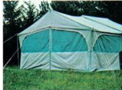
Add-A-Room uses your canopy to create an entire extra room.