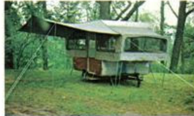
Canopy provides protection from sun or inclement weather.