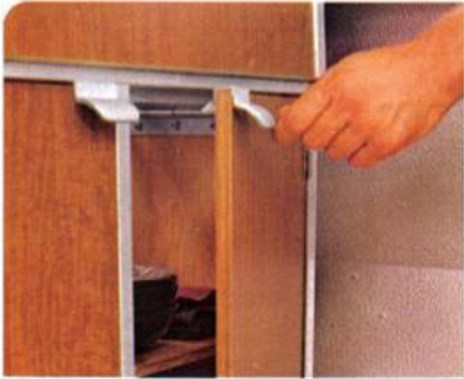
The cupboard and drawer pulls on the Ramada and Mesa III built-ins are of tough, pliable nylon. They're self-locking, corrosion-proof, good-looking.