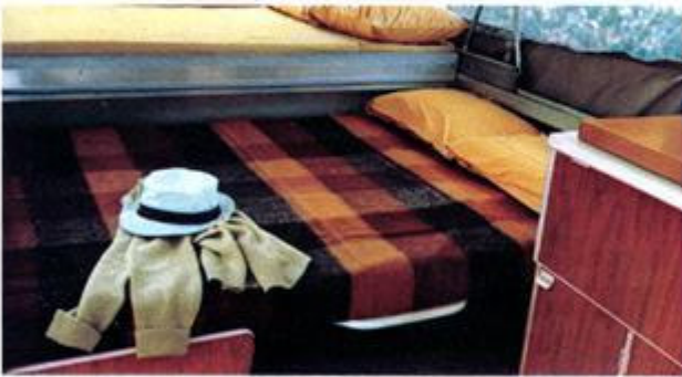
The dinette in Mesa II and III converts into a roomy double bed at night. What's underneath? Storage space aplenty!