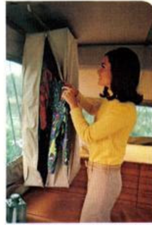
Also available as accessory option with this year's Ramada is a unique hanging wardrobe. It's made of heavy Army Duck. Unfastens easily, and lies flat when traveling. Sturdy, zipper closure keeps wardrobe clean.