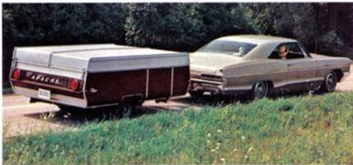
Clean, low, compact design, your Apache rides the road well, is easy on the gas tank.