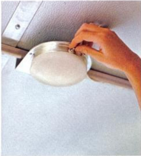
Flanged edge of new, portable, 12-volt auxiliary light permits easy attachment anywhere in trailer—or on outside as a night-light. Has frosted, glare-diffusing globe (and push-pull, on-and-off switch).