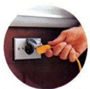
115-volt electrical system, manual reset circuit breaker, duplex outlet inside.* (Not available in Canada.)

*Not shipped installed to California or Washington.