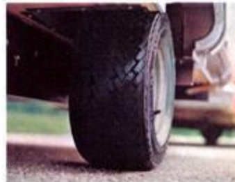
Wide, 4-ply rated tires have the new low profile—float better on sand or soft ground. Together with live-rubber torsion suspension, they provide safe, positive towing characteristics on the road.