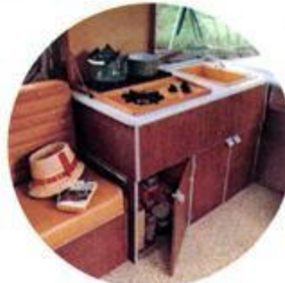
Galley cabinet in Mesa III has 3-burner range and sink, raises to work level.

Recommended carrying weight: 400 lbs. max. Color: Burnished Saddle Brown exterior, Alabaster interior.