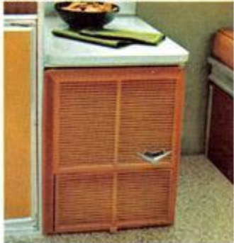
Automatic heater assembly provides 9000 BTU input.