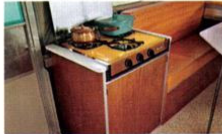
Ramada's new floor plan features permanent waist-high, 3-burner range across from galley cabinet for greater cooking efficiency and convenience. The range features front controls and stainless steel lid. Underneath is ample space for storing cooking utensils.

angle-contoured dinette seats that provide optimum seating comfort. Color-coordinated 4"-thick cushions on dinette and Gaucho couch are reversible—gold vinyl one side, gold upholstery on the other; and double-welted for longer wear. Electric brakes and complete bottle-gas hookup, including 20-lb. bottle and carrier. See pages F and G for more.