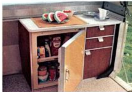
Another Mesa III feature is this generous storage and work space area that's "built around" the optional refrigerator. No problem to find a place to store things. No problem to find extra counter space.

with a color-coordinated, 3-burner range, sink* and shelf storage area. Bottle-gas hookup and carrier, too. Large water storage tank with handy outside fill. Like all Apaches, construction is of strong, lightweight, maintenance-free aluminum. Other features shown on pages F and G.