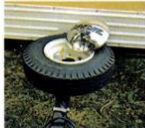
Key-locking continental kit for spare tire.