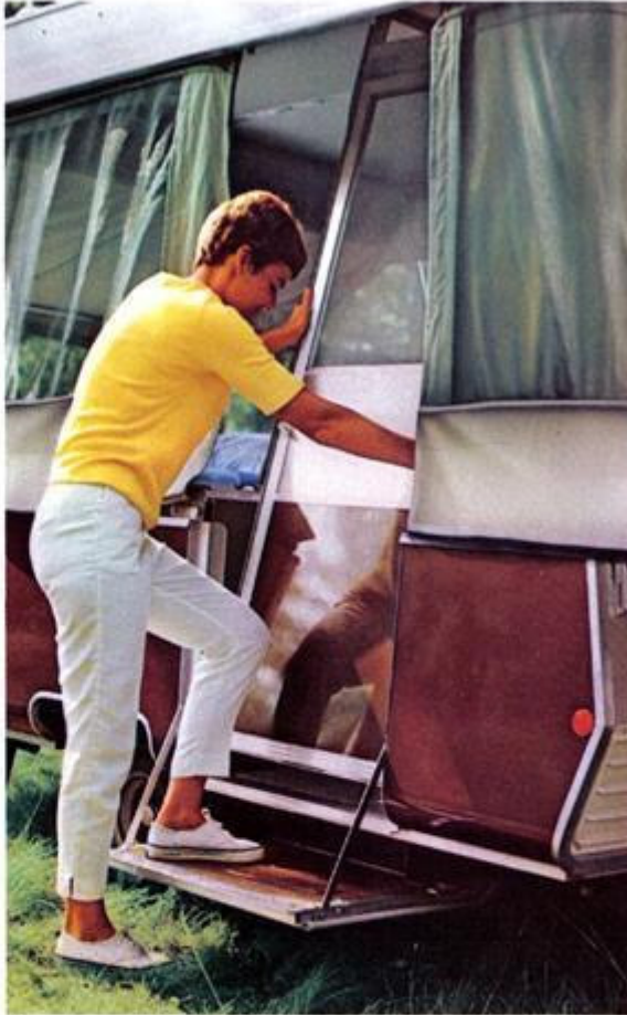
One-piece aluminum screen door stores in top of trailer when traveling. At camp, it rolls down in closed position with one easy movement. There's also an opaque, sliding, fiberglass panel for complete privacy—and use in inclement weather. Conventional spring-loaded stops let you set it at any desired intermediate position.