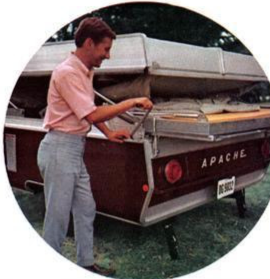
Beds crank out easily on efficient chain-drive mechanism, and road cover raises automatically to become the roof.