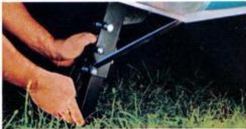
Unique Adjust-A-Level legs work like a car jack in adjusting to level position, if trailer is parked on uneven ground. Broad bases provide firm support. Legs swing up and lock into self-storing position.